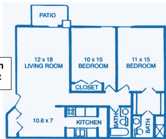
2 Bedroom 936 Sq. Ft