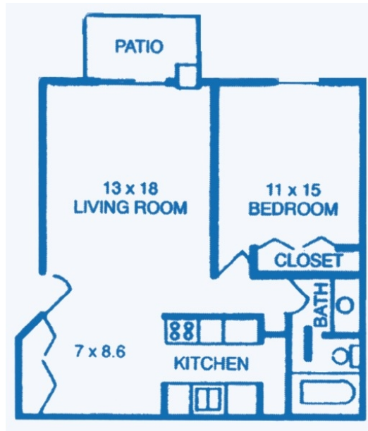
1 Bedroom 677 Sq. Ft